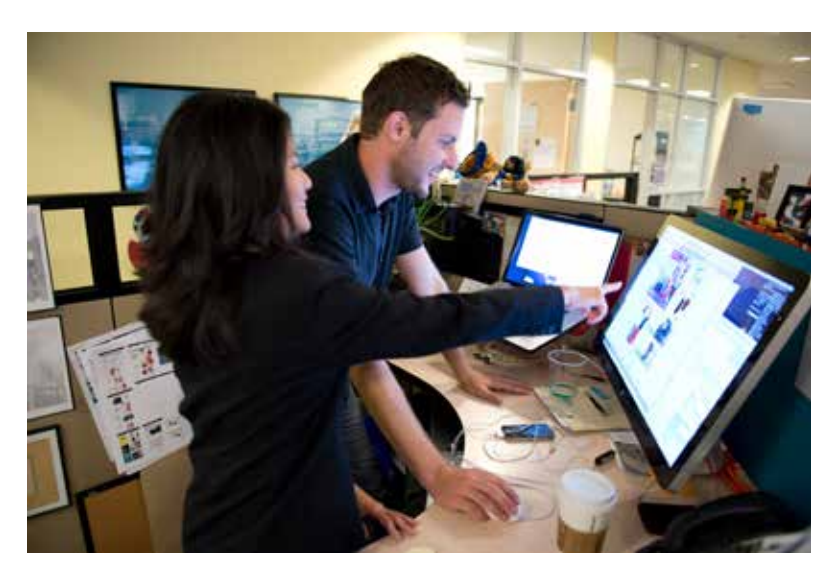
The retailer's e-commerce staff has quintupled to about 100 since Chin took control of the department in 2009.

Still, it's a juggling act, and Belk is trying to find its way in a market that seems to change by the hour. It's a challenge each company on the list faces. "A private company's online strategy depends on where they