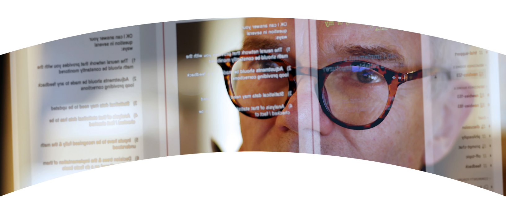
Image generation technology is not new, but AI has accelerated and drastically improved the quality and speed of creating and augmenting images from various sources. In the past year, revolutionary GenAI image generation tools have emerged that can turn words and pictures into stunning art. Recent advancements also enable users to send audio data through a GenAI model that creates music, sounds or voices.