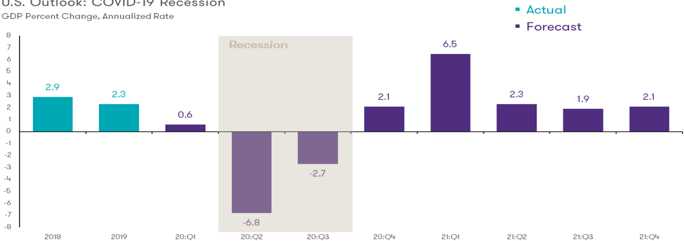
U.S. Outlook: COVID-19 Recession GDP Percent Change, Annualized Rate